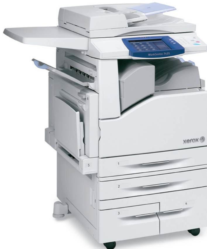
WorkCentre 7435 with Work Surface, High Capacity Tandem Tray and Integrated Office Finisher.