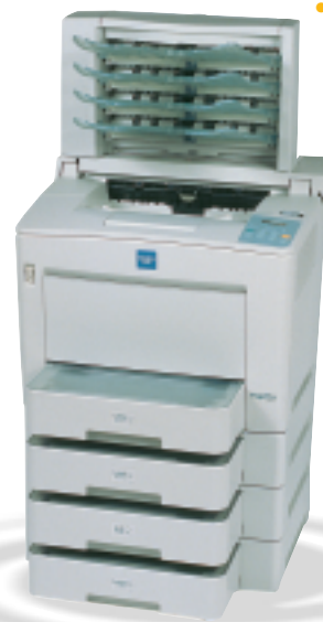
PagePro 9100 N with Optional 500-sheet Feeders and 4-bin Mailbox