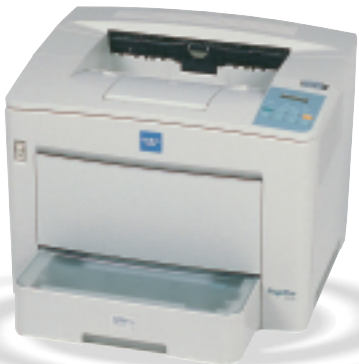
PagePro 9100 N