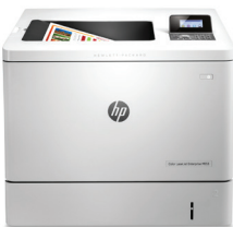
HP Color LaserJet Enterprise M553dn