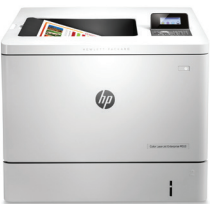
HP Color LaserJet Enterprise M553n

Speed and colour are the perfect pair for your business. That's why this energy-efficient printer and Original HP Toner cartridges with JetIntelligence combine to produce vibrant, professional-quality documents right when employees need them.