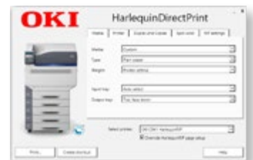
Harlequin MultiRIP 10